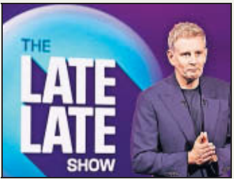
New Late Late host . . Patrick Kielty