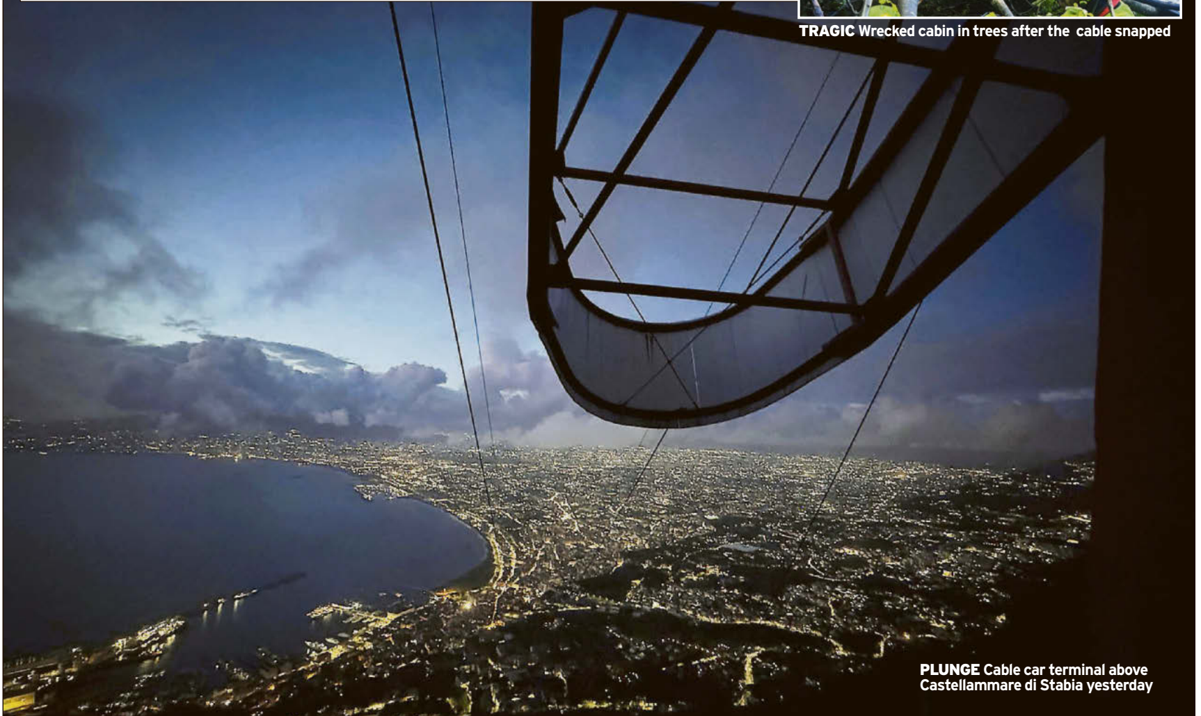
PLUNGE Cable car terminal above Castellammare di Stabia yesterday