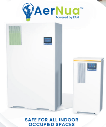
SAFE FOR ALL INDOOR OCCUPIED SPACES

GET IN TOUCH NOW FOR A FREE CONSULTATION