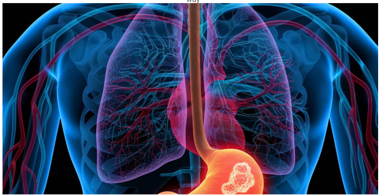
A graphic of a stomach tumour. Thanks to the internet, patients can keep abreast of latest options for treating their cancers in leading centres in the US and elsewhere.

Cancer medicine is undergoing a revolution, with scores of new treatments targeting specific tumours on the