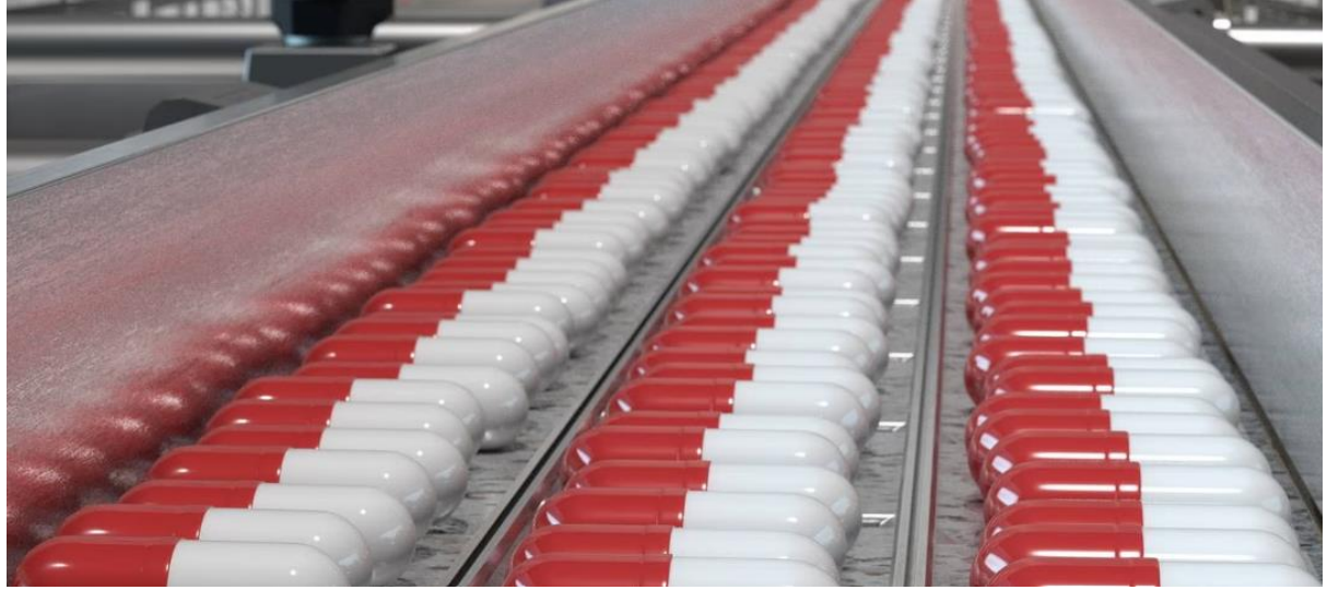
Irish Life Health and Laya Healthcare say they will provide cover for the treatments as soon as the drugs are clinically approved by the European Medicines Agency

Public patients may now have to wait up to two years longer than all private patients for access to innovative therapies